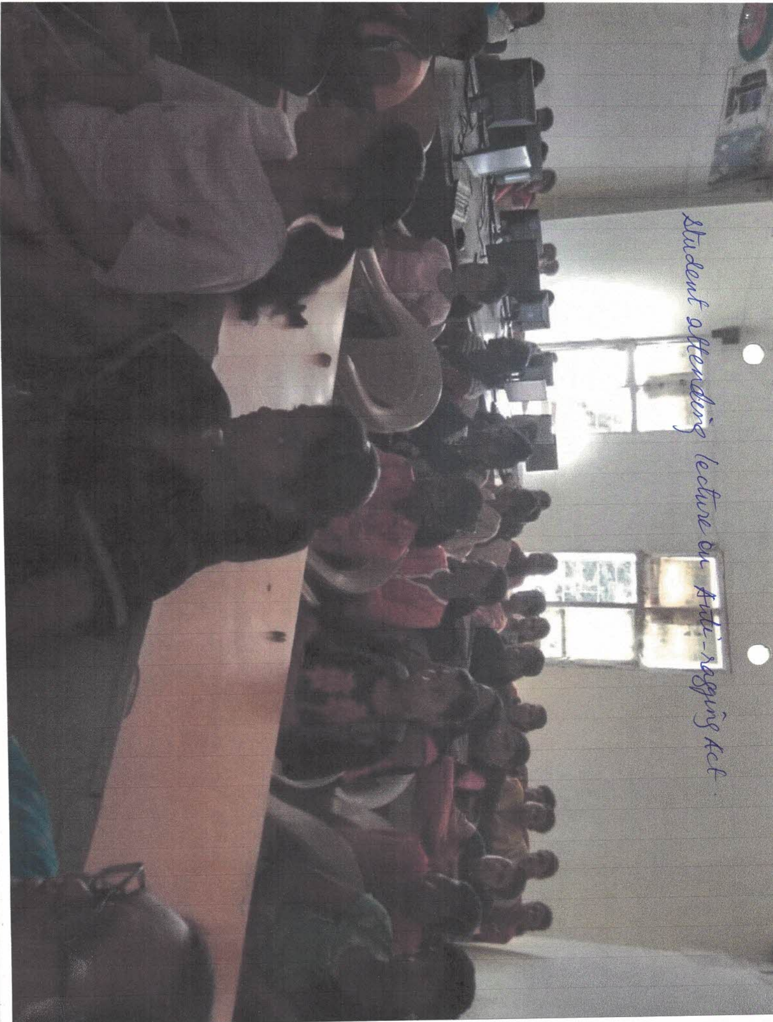
Student attending's lecture on Anti-ragging Act.